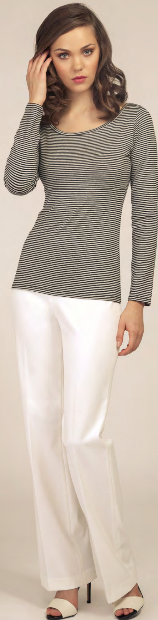
JERSEY TOP - JS083 BLACK/GRAY PANTS - 1018 IVORY