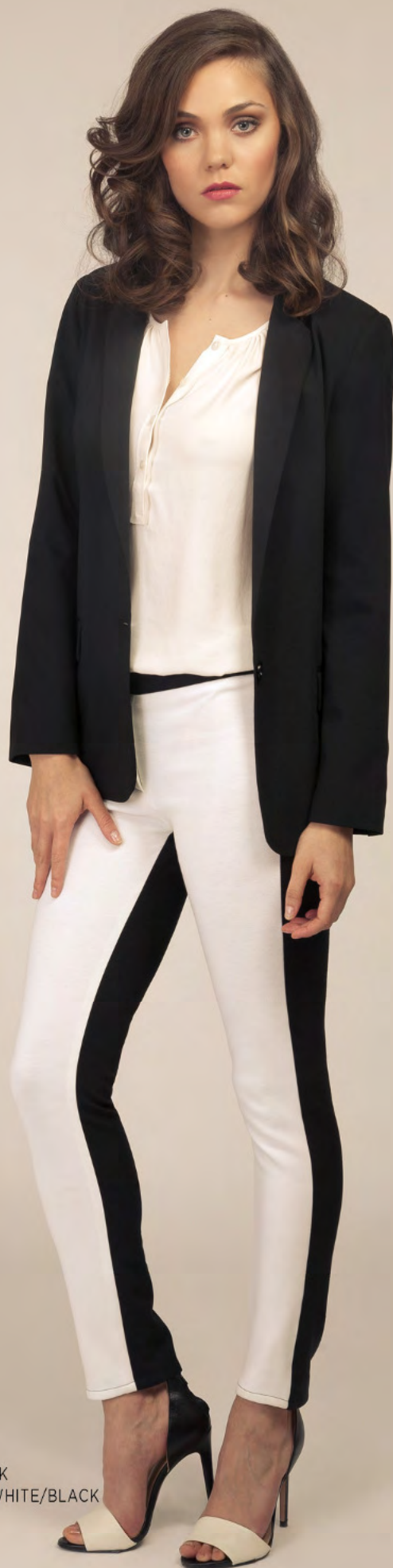
JACKET (SPECIAL ORDER) - i229 BLACK LEGGINGS (SPECIAL ORDER) - 1P020 WHITE/BLACK