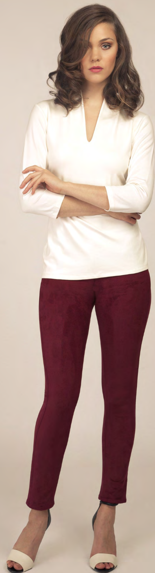
JERSEY TUNIC - FT091 ECRU LEGGINGS - 1FS002 WINE