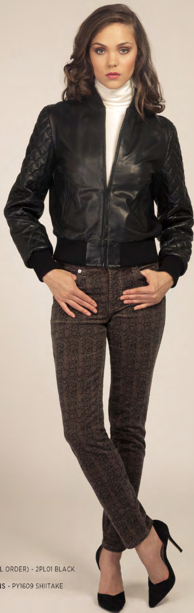
LEATHER JACKET (SPECIAL ORDER) - 2PL01 BLACK JERSEY TOP - FT011 ECRU PRINTED CORDUROY JEANS - PY1609 SHIITAKE