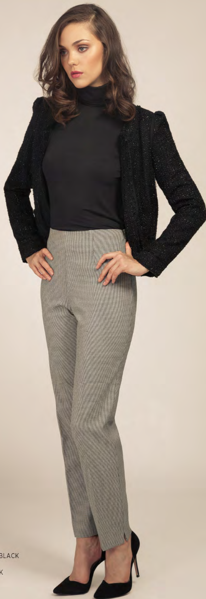
JACKET (SPECIAL ORDER) - i201 BLACK JERSEY TOP - FT011 BLACK CIGARETTE SLACKS - 1035 CHECK