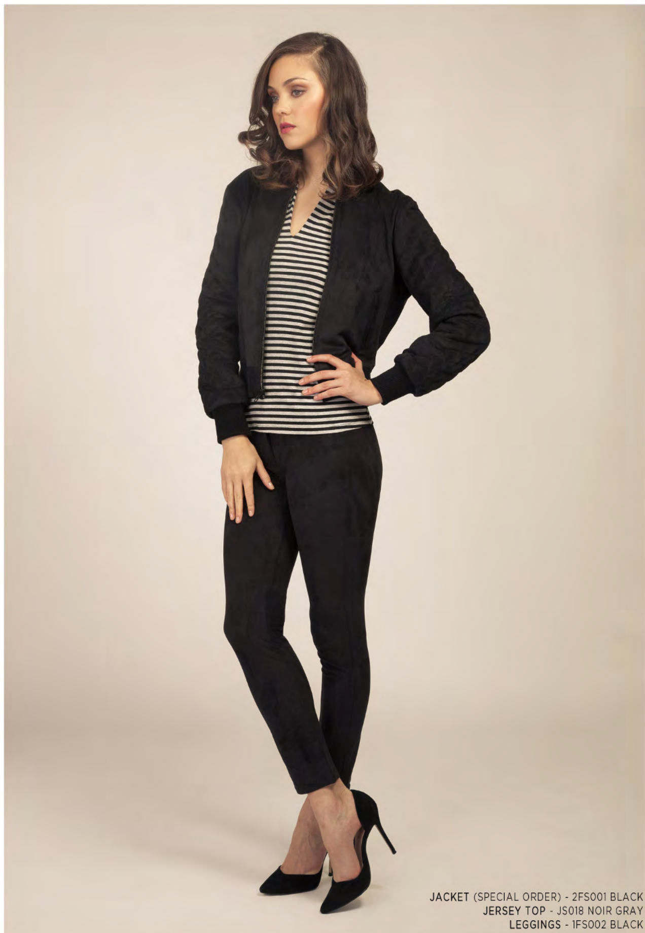
JACKET (SPECIAL ORDER) - 2FS001 BLACK JERSEY TOP - JS018 NOIR GRAY LEGGINGS - 1FS002 BLACK