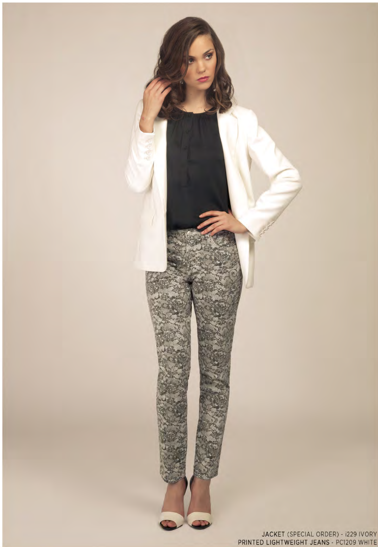
JACKET (SPECIAL ORDER) - i229 IVORY PRINTED LIGHTWEIGHT JEANS - PC1209 WHITE