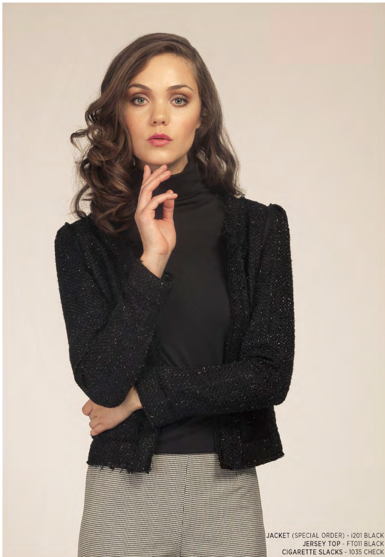
JACKET (SPECIAL ORDER) - i201 BLACK JERSEY TOP - FT011 BLACK CIGARETTE SLACKS - 1035 CHECK