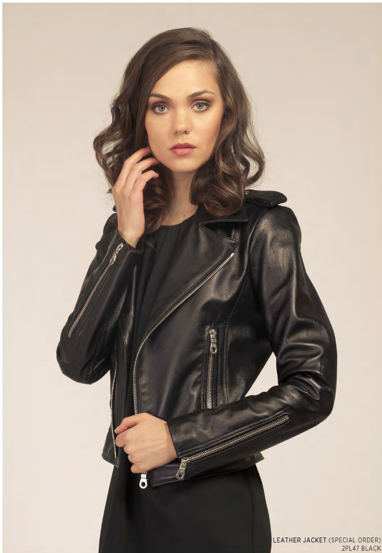
LEATHER JACKET (SPECIAL ORDER) 2PL47 BLACK